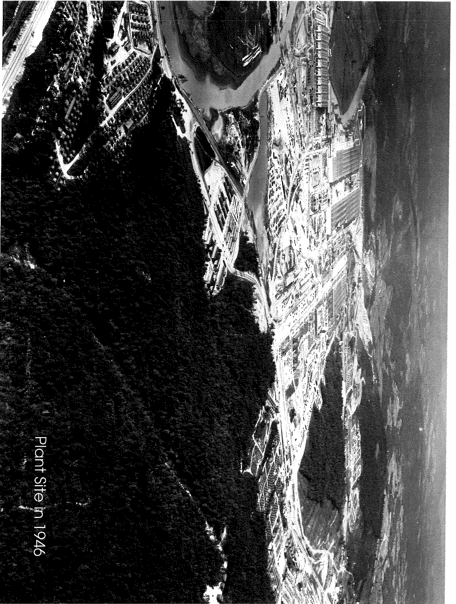
Plant Site in 1946