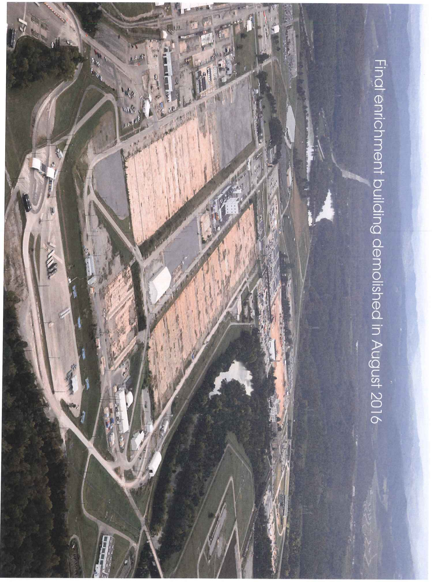
Final enrichment building demolished in August 2016